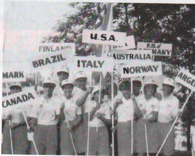
Jr. Sailors carrying placards of participating nations at 1985 Soling World Championships.

From the beginning, the Sea Scouts worked in conjunction with SYC to offer youth sailing training programs. By the early