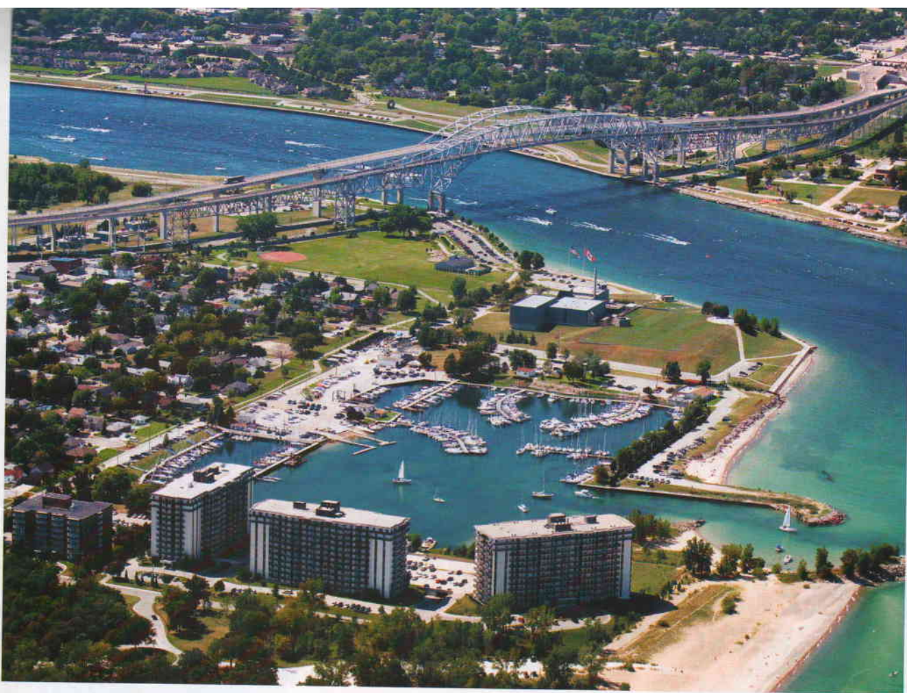
SYC aerial picture taken in 2013 - with fine view of Blue Water Bridge.

Not to get too complacent, when the Salt Company decided not to renew their lease, another move put them up-river on Lake Huron at Point Edward in 1956, with a long-term lease from the Federal Government. These Do-it-Yourselfers were not deterred and with thousands of membership hours they again built the docks and put up the buildings on what was to become their (today's) permanent location. The original charter declared them to be, "An aquatic and social organization consisting of sailors, cruisers, outboards, canoeists, racing shells and swimmers principally to encourage boat racing and