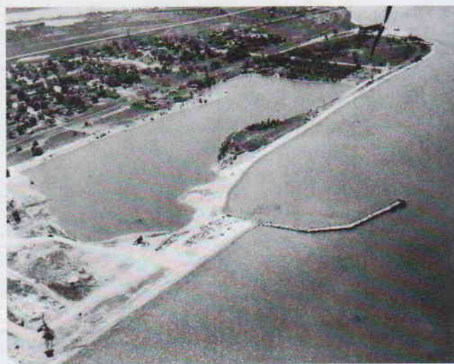
SYC Basin June 1955.

we now see the beginnings of the Sarnia Yacht Club, founded in 1930, where the 115 members built docks and used the old tennis building from the City Parks Department at the end of London Road in Sarnia Bay for their first location. But by 1932 they were forced to move again, leasing land from the Dominion Salt Company at the end of Exmouth Street. The enterprising members again built new docks and refurbished a donated clubhouse.