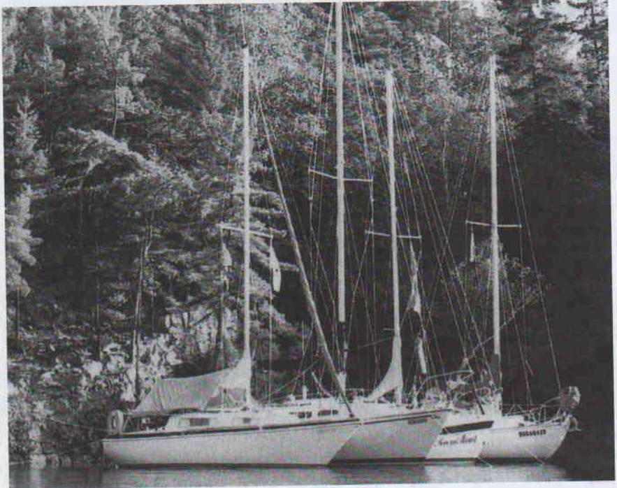
1984 SYC boats at Bay Finn Anchorage.

Toll Free: 1-866-912-6926 Email: info@cowangroup.ca www.cowangroup.ca